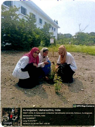
Tree Plantation .