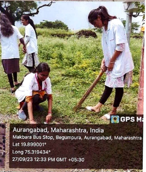
Aurangabad, Maharashtra, India Makbara Bus Stop, Begumpura, Aurangabad, Maharashtra Lat 19.899001° Long 75.319434° 27/09/23 12:33 PM GMT +05:30