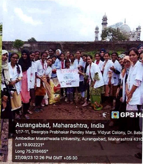
Aurangabad, Maharashtra, India 1/17-11, Swargiya Prabhakar Pandey Marg, Vidyut Colony, Dr. Babasaheb Ambedkar Marathwada University, Aurangabad, Maharashtra 431004 Lat 19.902221° Long 75.318465° 27/09/23 12:26 PM GMT +05:30