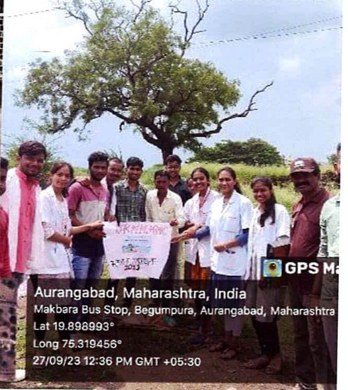
Aurangabad, Maharashtra, India Makbara Bus Stop, Begumpura, Aurangabad, Maharashtra Lat 19.898993° Long 75.319456° 27/09/23 12:36 PM GMT +05:30