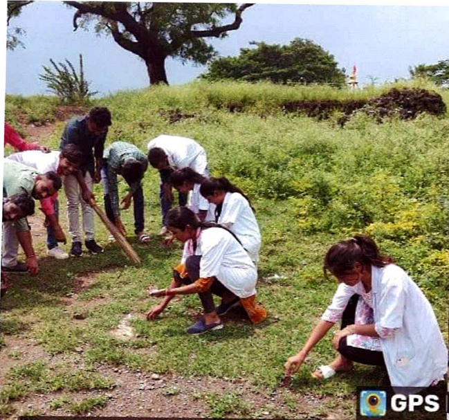
Aurangabad, Maharashtra, India Makbara Bus Stop, Begumpura, Aurangabad, Maharashtra Lat 19.899008° Long 75.319447° 27/09/23 12:34 PM GMT +05:30