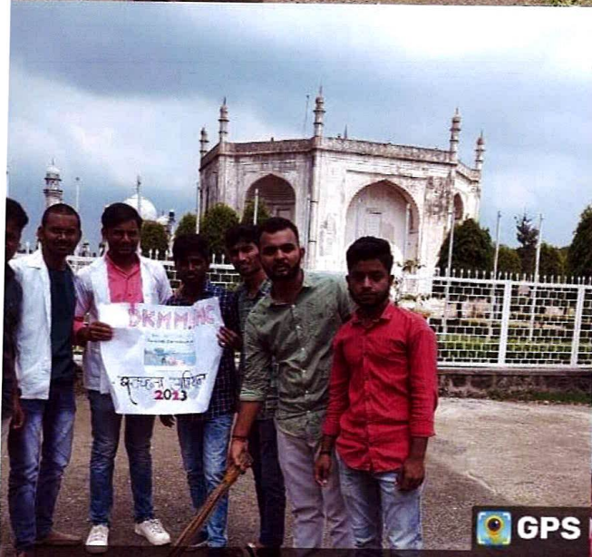
Aurangabad, Maharashtra, India V8XC+H22, Begumpura, Aurangabad, Maharashtra Lat 19.898848° Long 75.319941° 27/09/23 12:31 PM GMT +05:30